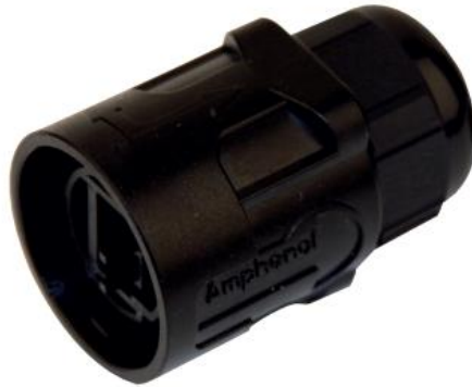
IP67 shell for cord

3M shell is also proposed, it can fit any RJ45 patch cord, whether watertight or standard. Without any tool, you can therefore improve your patch cord in order to fit any IP67 receptacle of the I67K5E and I67K6 series.